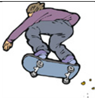
Bodily-Kinesthetic Intelligence or Body Smart

This intelligence relates to physical movement in areas such as control over body movements, balance, and agility.